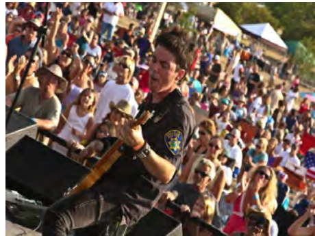
The above images and the photo used in the July 2011 Newsletter Header were taken by Kristy Duff Wallace and provided by the City of Hutto .