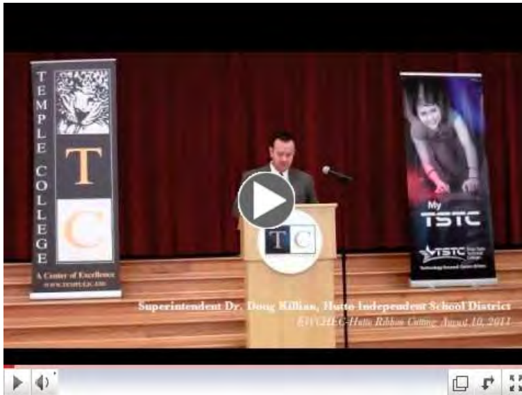
Video Presentation of the August 10, 2011 East Williamson County Higher Education Center Ribbon Cutting at the Veteran's Hill Campus.

College began offering classes for the Fall 2011 semester in Hutto. Though the planned higher education facility that will be located off of SH130 on a 57-acre campus will not open until 2013, Temple College and Texas State Technical College are utilizing Hutto ISD's vacated Veteran's Hill Elementary School to start establishing a solid student base and begin aiding residents pursuing higher education and technical training. A partnership with Texas A&M Central Texas is also being pursued so that within 2-4 years, 3rd and 4th year courses, as well as graduate level courses will be offered alongside state of the art technical training and local community development.