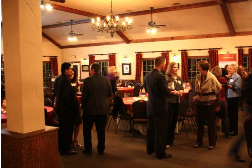
Hutto EDC 2010 Year-In-Review Banquet, November 19, 2010. The Golf Club at Star Ranch.