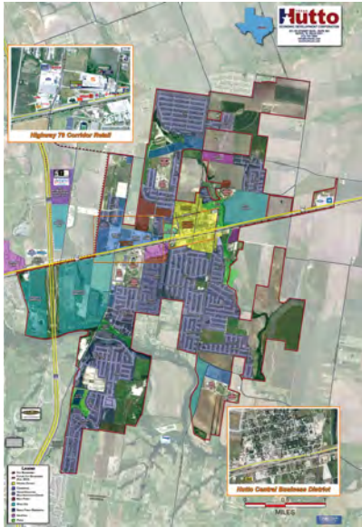
2011 Hutto Aerial Map

The Hutto Economic Development Corporation published the 2011 Aerial Map & Community Information for Hutto, Texas. This piece features an aerial map with zoning data, subdivision information, city limits, national retailers, public interest facilities, and local businesses driven by the tourist industry such as eateries, gift shops, lodging facilities, and medical clinics. The reverse side of the aerial map features an array of community information, maps, demographics, and facts.