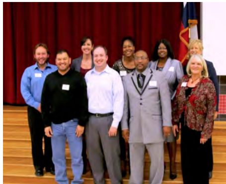
Hutto Entrepreneur & Small Business Academy 2011 Graduates

On December 12, 2011, eight community members completed the Hutto Entrepreneur and Small Business Academy. A graduation ceremony was held at the Veteran's Hill facility of the East Williamson County Higher Education Center - Hutto Center. Each student gave a short presentation explaining the significance of the program and concepts learned in their own business development process.