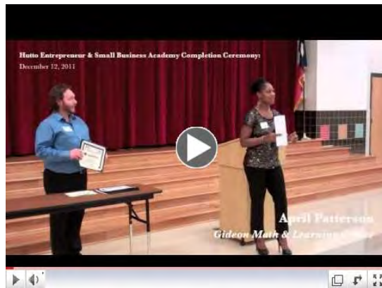
Hutto Entrepreneurs & Small Business Academy Graduation, Student Presentation. Dec. 12, 2011.

For pictures from the event, click here . For a video of student presentations, click on the image below or click here .